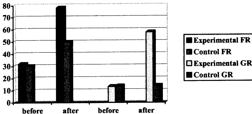
Table 1. Comparative results of the two studies, in France and in Greece

Over a year, in both countries, we taught body expression to the five-year-olds in the experimental groups. In the beginning and the end of the school year, the experimental groups, as well as the corresponding control groups were tested in the acquisition of specific cognitive and psychomotor skills (see Table 1). We also observed and studied the development of these children over the next years, when they were in primary school.